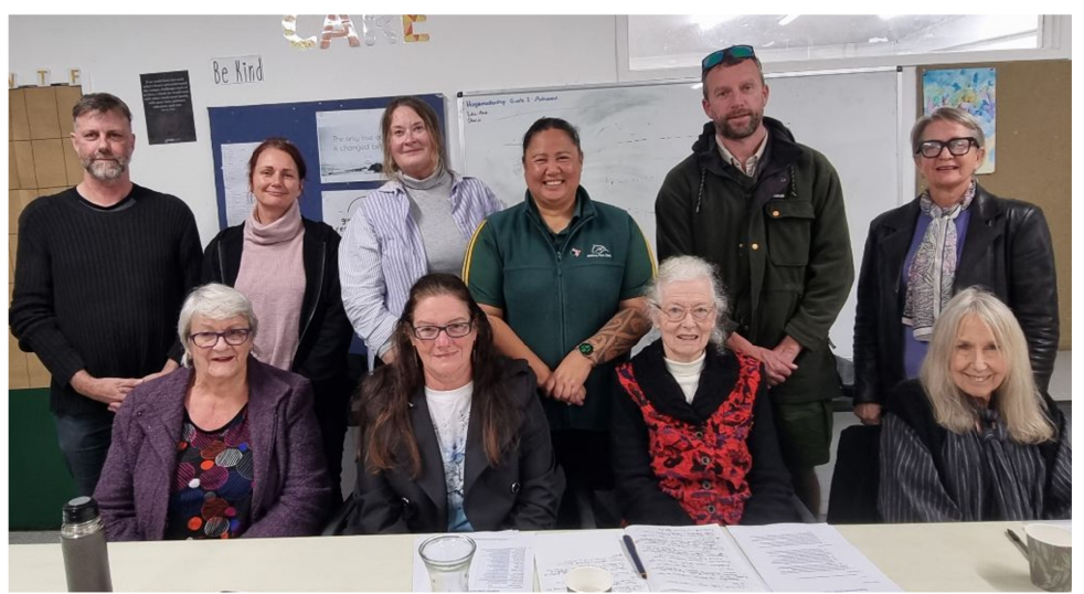
Ambury Park Centre AGM, June 2024

A note to our staff, thank you! Your commitment is the reason that we exist. It is the reason that the people we serve trust us and engage fully in the services that we provide. Thank you also to all of our volunteers for offering your time and expertise, we value you all.