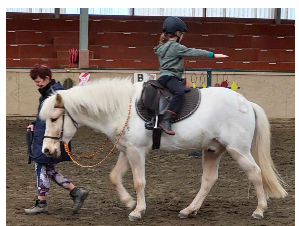
RDA Ride in action

RDA Programme: As mentioned the intensive riding therapy is minimal currently but normally operates for many clients, mainly children, with significant disabilities. Ambury's intensive therapy combines Riding therapy, Hippotherapy and Physiotherapy. The gait of the horse works on the muscles of human uprightness and along with hippotherapy is able to target specific parts of the body. The magic of this work and the relationship with the horse enable significant improvements in mobility, speech and other cognitive developments. In the remedial programme, the riders may graduate from Intensive or join the programme with less severe disabilities. They also present with issues such as neuro- divergence, depression, social anxiety and other mental health challenges. Again the riding therapy and the relationship with the horse work magic physically, socially, cognitively and psychologically.