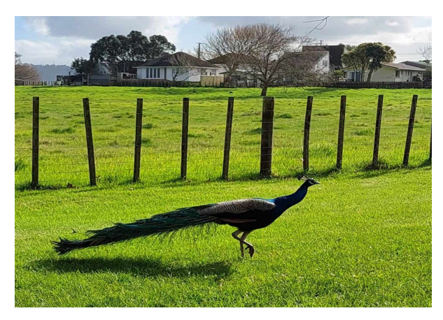
Our old friend Barry the Peacock