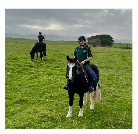
Riding with Teka

Redhead Rupert and tall Tama joined the herd a few months back, proving popular with riders, including staff. Versatile Gypsy Cobb Charlie arrived in January. She rides with our Blues riders as well as RDA and supplies endless cuddles to all. She is also a firm grooming favourite for the