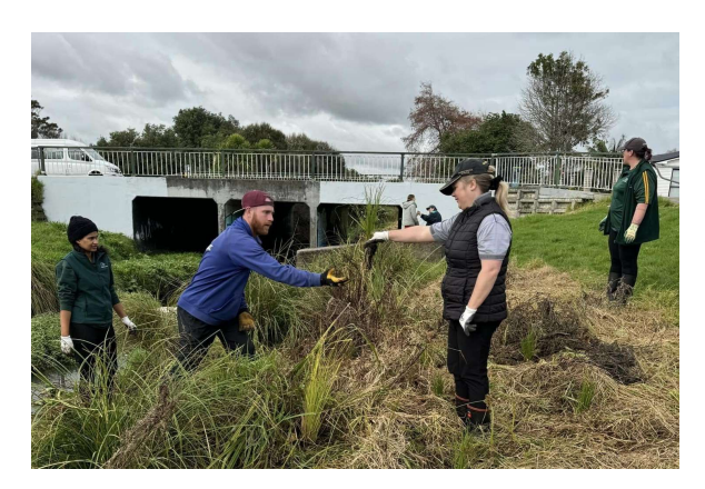
Vocs planting at Te Ara Rata Stream

workers assist with the Vocational programme. It is a wonderfully busy Centre where our dedicated staff ensure much positive work happens.