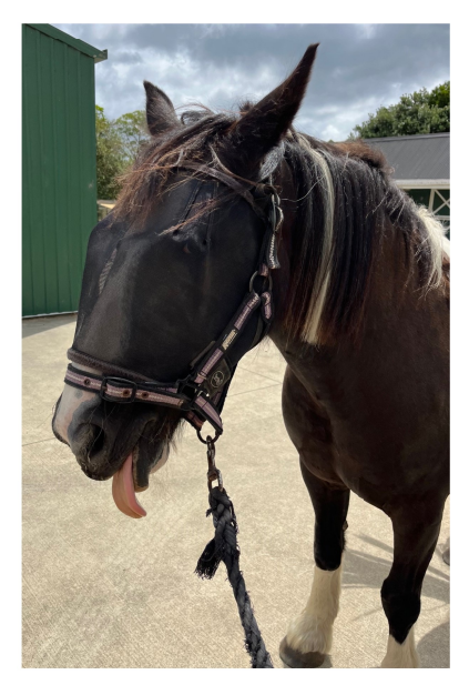
Mesh masks help protect our horses faces from UV light and infection

Outside normal working hours we ran a few events. The Ambury Park Centre Horse Show in March hosted a dozen entrants competing in Working Equitation and Dressage Tests, who received valuable feedback as well as ribbons. In May we held the Ambury Special Olympics, allowing riders to compete in equestrian events and receive valuable coach feedback and accolades. Thanks to volunteer effort from judges, staff and