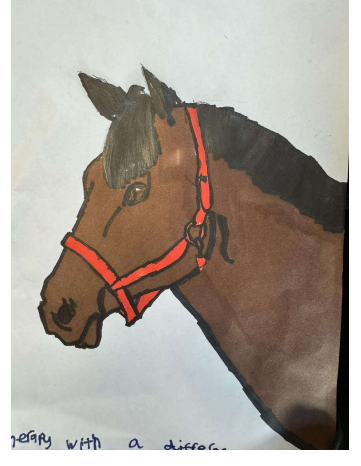
Horse art by Gena