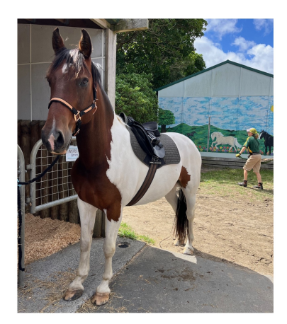
New boy Tama

The current Ambury herd stands at eighteen horses. Although we have fewer than usual, all our current horses are fit and in active work, and generally younger than in the past. This has allowed changes to fitness programmes, training and work load. Diversity of work and play helps keep our horses happy and healthy in mind and body. We suddenly have several paints and chestnuts, making identification in low light, at a distance or with covers on a fun experience!