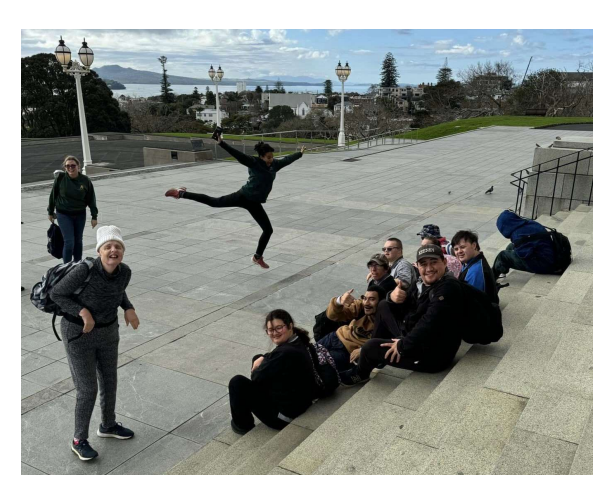
Vocs trip to the museum